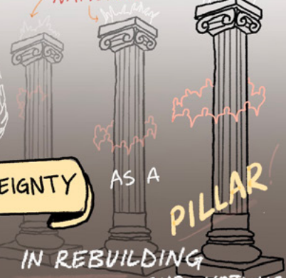
Graphic illustration from virtual gathering

FOOD IS A KEY PIECE FOR HEALTH OF OUR NATIONS.